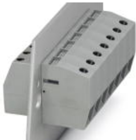
The illustration shows version HDFK 25 in gray

Please be informed that the data shown in this PDF Document is generated from our Online Catalog. Please find the complete data in the user's documentation. Our General Terms of Use for Downloads are valid ( http://phoenixcontact.com/download )