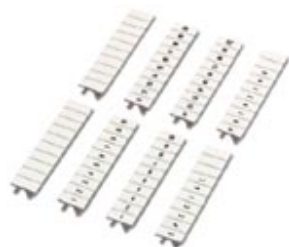
Zack marker strip, 10-section, horizontally labeled with the consecutive numbers: 381 ... 390, white, Width: 5 mm

Please be informed that the data shown in this PDF Document is generated from our Online Catalog. Please find the complete data in the user's documentation. Our General Terms of Use for Downloads are valid ( http://download.phoenixcontact.com )