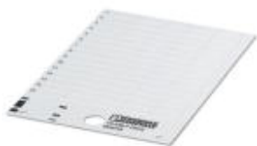
The figure shows the US-EMLP (20x9) version

Plastic label, Card, white, Unlabeled, Can be labeled with: THERMOMARK CARD PLUS, THERMOMARK CARD, Mounting type: Adhesive, Lettering field: 27 x 12.5 mm