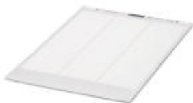
The figure shows a version of the article

Label sheet, DIN A4, Sheet, white, unlabeled, can be labeled with: Office printing systems, Mounting type: Adhesive, Lettering field: 50 x 12 mm