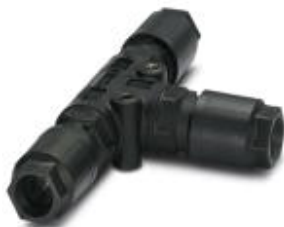
QUICKON T-distributor, black, 4+PE-pos., 1.0 mm 2 ... 2.5 mm 2 /690 V/20 A, for cable diameter of 9 mm ... 16 mm, with three QUICKON nuts

Please be informed that the data shown in this PDF Document is generated from our Online Catalog. Please find the complete data in the user's documentation. Our General Terms of Use for Downloads are valid ( http://phoenixcontact.com/download )