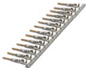
Rolled pin contact, taped, silver-plated, 0.14 mm 2 ... 0.5 mm 2 , contact entry from left, 2000 pcs. per roll

Please be informed that the data shown in this PDF Document is generated from our Online Catalog. Please find the complete data in the user's documentation. Our General Terms of Use for Downloads are valid ( http://phoenixcontact.com/download )