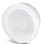
Plastic dust protection cap with IP40 eye for connectors with M23 external thread, RF, SF series

Plastic dust protection cap - SF-Z0019 - 1607449