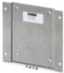
Mounting plate for SFNT switches

Mounting plate - FL PA SFNT 5-8 - 2891012