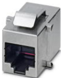
RJ45 socket insert, modular (Keystone), CAT5e, 8-pos., shielded, socket on socket

Please be informed that the data shown in this PDF Document is generated from our Online Catalog. Please find the complete data in the user's documentation. Our General Terms of Use for Downloads are valid ( http://phoenixcontact.com/download )