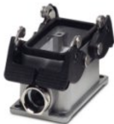
Box mounting base, with double locking latch, height 52 mm, with screw connection, 1x Pg16

Please be informed that the data shown in this PDF Document is generated from our Online Catalog. Please find the complete data in the user's documentation. Our General Terms of Use for Downloads are valid ( http://phoenixcontact.com/download )