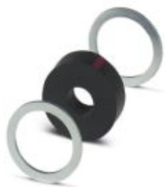
Notched seals/2 washers, for pressure screws, type Pg29

Please be informed that the data shown in this PDF Document is generated from our Online Catalog. Please find the complete data in the user's documentation. Our General Terms of Use for Downloads are valid ( http://phoenixcontact.com/download )