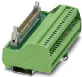
VARIOFACE interface module, for MODICON® TSX Quantum, with MODICON®-specific labeling, for I/O of 32 channels

Please be informed that the data shown in this PDF Document is generated from our Online Catalog. Please find the complete data in the user's documentation. Our General Terms of Use for Downloads are valid ( http://phoenixcontact.com/download )