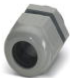
Cable gland, Cable gland material: Polyamide 6, External cable diameter 11 mm ... 17 mm, Shielding: No, Connecting thread: M25, Color: silver grey

Cable gland - G-INS-M25-M68N-PNES-GY - 1411126