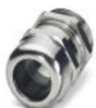
Cable gland, Cable gland material: Brass, nickel-plated, External cable diameter 11 mm ... 17 mm, Shielding: No, Connecting thread: M25, Color: silver

Cable gland - G-INS-M25-M68N-NNES-S - 1411165