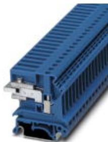
N disconnect terminal block, Screw connection, Cross section: 0.2 mm 2 - 6 mm 2 , AWG: 24 - 10, Width: 6.2 mm, Color: blue, Mounting type: NS 35/7,5, NS 35/15, NS 32

Please be informed that the data shown in this PDF Document is generated from our Online Catalog. Please find the complete data in the user's documentation. Our General Terms of Use for Downloads are valid ( http://phoenixcontact.com/download )