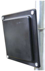
Optional Pole Mount