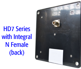
HD7 Series with Integral N Female (back)