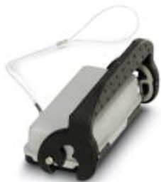
HEAVYCON protective cover, type B16, for sleeve housing without single locking latch, with retaining cord, IP54

Please be informed that the data shown in this PDF Document is generated from our Online Catalog. Please find the complete data in the user's documentation. Our General Terms of Use for Downloads are valid ( http://download.phoenixcontact.com )