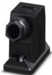
HEAVYCON ADVANCE B10 sleeve housing, with screw locking (Allen screw), plastic, height: 100 mm, with 1 x M25 thread, lateral cable outlet

Please be informed that the data shown in this PDF Document is generated from our Online Catalog. Please find the complete data in the user's documentation. Our General Terms of Use for Downloads are valid ( http://download.phoenixcontact.com )