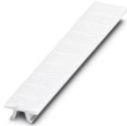
Zack marker strip, 10-section, horizontally labeled with the consecutive numbers: 201 ... 210, white, Width: 6 mm

Please be informed that the data shown in this PDF Document is generated from our Online Catalog. Please find the complete data in the user's documentation. Our General Terms of Use for Downloads are valid ( http://download.phoenixcontact.com )