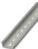
DIN rail, material: steel galvanized and passivated with a thick layer, perforated, height 7.5 mm, width 35 mm, length: 2000 mm

DIN rail perforated - NS 35/ 7,5 PERF 2000MM - 0801733