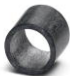
Adapter sleeve, Nominal current: 50 A, Color: white

Mounting material - SH-SE 14/18 - 0913317