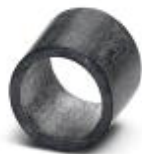
Adapter sleeve, Nominal current: 25 A, Color: yellow