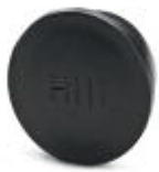
Plastic dust protection cap, anti-static, for RF, SF series connectors, with M23 external thread

Plastic anti-static dust protection cap - RC-Z2469 - 1611797