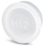
Plastic dust protection cap for connectors with M23 external thread

Plastic dust protection cap - RC-Z2059 - 1604225