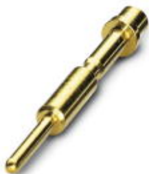
Crimp contact, turned, Single contact, contact diameter: 1 mm, crimp range: 0.25 mm 2 ... 1 mm 2

Please be informed that the data shown in this PDF Document is generated from our Online Catalog. Please find the complete data in the user's documentation. Our General Terms of Use for Downloads are valid ( http://phoenixcontact.com/download )