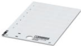
The illustration shows a version of the product

Plastic label, Card, white, Unlabeled, Can be labeled with: THERMOMARK CARD PLUS, THERMOMARK CARD, Mounting type: Adhesive, Lettering field: 49 x 15 mm