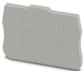
End cover, Length: 33.6 mm, Width: 2.2 mm, Height: 22.3 mm, Color: gray

Please be informed that the data shown in this PDF Document is generated from our Online Catalog. Please find the complete data in the user's documentation. Our General Terms of Use for Downloads are valid ( http://phoenixcontact.com/download )