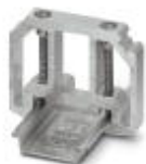
End clamp, for end support of UKH 50 to UKH 240, is pushed onto DIN rail NS 35 and fixed with 2 screws, width: 10 mm, color: aluminum