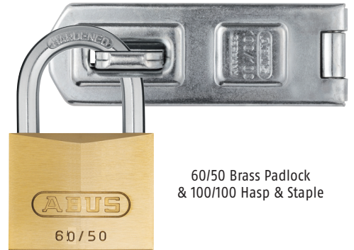
60/50 Brass Padlock & 100/100 Hasp & Staple