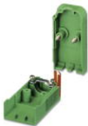
Cable housing, pitch: 0 mm, number of positions: 3, dimension a: 24.66 mm, color: green

Please be informed that the data shown in this PDF Document is generated from our Online Catalog. Please find the complete data in the user's documentation. Our General Terms of Use for Downloads are valid ( http://phoenixcontact.com/download )