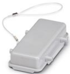
HEAVYCON protective cover, series B16, for supporting base element with double locking latch, with retaining cord, IP54, PA

Please be informed that the data shown in this PDF Document is generated from our Online Catalog. Please find the complete data in the user's documentation. Our General Terms of Use for Downloads are valid ( http://download.phoenixcontact.com )