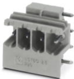
Header, Nominal current: 16 A, Rated voltage (III/2): 320 V, Number of positions: 4, Pitch: 5 mm, Mounting: Soldering

Please be informed that the data shown in this PDF Document is generated from our Online Catalog. Please find the complete data in the user's documentation. Our General Terms of Use for Downloads are valid ( http://phoenixcontact.com/download )