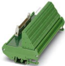
VARIOFACE initiator module with spring-cage terminal blocks, for connecting 32 PNP initiators

Please be informed that the data shown in this PDF Document is generated from our Online Catalog. Please find the complete data in the user's documentation. Our General Terms of Use for Downloads are valid ( http://phoenixcontact.com/download )