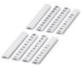
Zack Marker strip, flat, Strip, white, labeled, Printed horizontally: Consecutive numbers 1 - 10, 11 - 20, etc. up to 491 - 500, Mounting type: Snap into flat marker groove, for terminal block width: 5 mm, Lettering field: 5.15 x 5.15 mm

Zack Marker strip, flat - ZBF 5,LGS:FORTL.ZAHLEN - 0808671