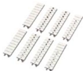
Zack marker strip, 10-section, horizontally labeled with the consecutive numbers: 181 ... 190, white, Width: 5 mm

Please be informed that the data shown in this PDF Document is generated from our Online Catalog. Please find the complete data in the user's documentation. Our General Terms of Use for Downloads are valid ( http://download.phoenixcontact.com )