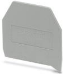
End cover, Length: 43 mm, Width: 1.5 mm, Color: gray

Please be informed that the data shown in this PDF Document is generated from our Online Catalog. Please find the complete data in the user's documentation. Our General Terms of Use for Downloads are valid ( http://phoenixcontact.com/download )