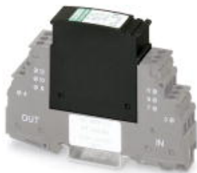
The figure shows the PT 1x2-48DC-ST version

PT protective connector with protective circuit for a 2-wire floating signal circuit. HART-compatible.