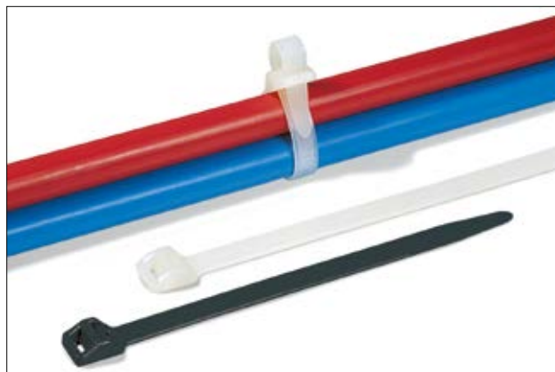
Ideal for larger or heavier bundles these ties can be opened and reused.