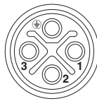
Connector pin assignment of M12 socket, 4-pos., S-coded, view of socket side