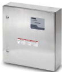
Combination lightning arrester and TVSS system for ungrounded 480 V Delta systems

Please be informed that the data shown in this PDF Document is generated from our Online Catalog. Please find the complete data in the user's documentation. Our General Terms of Use for Downloads are valid ( http://phoenixcontact.com/download )