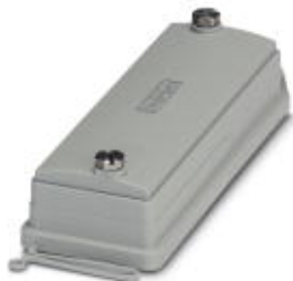
HEAVYCON ADVANCE B24 IP65 protective cover, for panel mounting side, with screw locking, with retaining cord, diameter of retaining cord eyelet: 3 mm

Please be informed that the data shown in this PDF Document is generated from our Online Catalog. Please find the complete data in the user's documentation. Our General Terms of Use for Downloads are valid ( http://phoenixcontact.com/download )