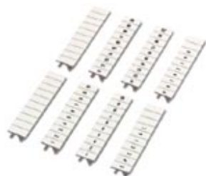
Zack marker strip, 10-section, horizontally labeled with the consecutive numbers: 291 ... 300, white, Width: 5 mm

Please be informed that the data shown in this PDF Document is generated from our Online Catalog. Please find the complete data in the user's documentation. Our General Terms of Use for Downloads are valid ( http://download.phoenixcontact.com )