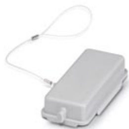
HEAVYCON protective cover, type B16, for supporting base element with single locking latch, with retaining cord, IP54, PA

Please be informed that the data shown in this PDF Document is generated from our Online Catalog. Please find the complete data in the user's documentation. Our General Terms of Use for Downloads are valid ( http://download.phoenixcontact.com )