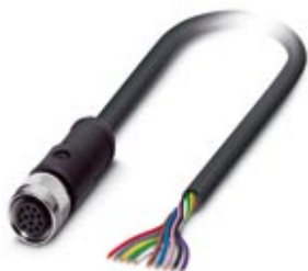
Master cable, 12-position, PUR/PVC, Black RAL 9005, free cable end, on Socket straight M12, A-coded, Cable length: 10 m

Please be informed that the data shown in this PDF Document is generated from our Online Catalog. Please find the complete data in the user's documentation. Our General Terms of Use for Downloads are valid ( http://phoenixcontact.com/download )