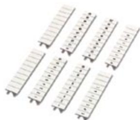
Zack marker strip, 10-section, horizontally labeled with the consecutive numbers: 151 ... 160, white, Width: 5 mm

Please be informed that the data shown in this PDF Document is generated from our Online Catalog. Please find the complete data in the user's documentation. Our General Terms of Use for Downloads are valid ( http://download.phoenixcontact.com )