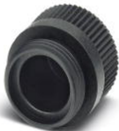
Sealing cap, 7/8", plastic, for flush-type connectors, for 7/8" sockets

Please be informed that the data shown in this PDF Document is generated from our Online Catalog. Please find the complete data in the user's documentation. Our General Terms of Use for Downloads are valid ( http://phoenixcontact.com/download )