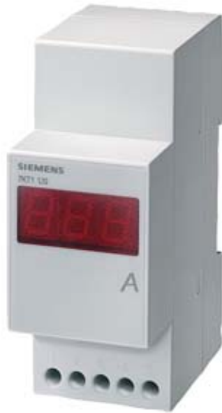
AMPERE-METER, DIGITAL AC 25A +999/5A, DEPTH=70MM FOR DIRECT AND TRANSF.CONNEC.