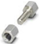
Mounting set, for DSUB gender changer contact inserts