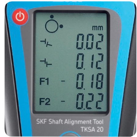
Live alignment results makes corrections easy