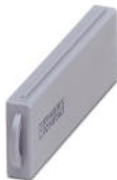
VARIOCON dust cover for panel mounting frame, with IP40 protection, type 2

Please be informed that the data shown in this PDF Document is generated from our Online Catalog. Please find the complete data in the user's documentation. Our General Terms of Use for Downloads are valid ( http://phoenixcontact.com/download )