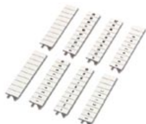
Zack marker strip, 10-section, horizontally labeled with the consecutive numbers: 141 ... 150, white, Width: 5 mm

Please be informed that the data shown in this PDF Document is generated from our Online Catalog. Please find the complete data in the user's documentation. Our General Terms of Use for Downloads are valid ( http://download.phoenixcontact.com )