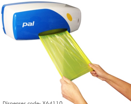
Dispenser code: X64110

The aprons are supplied on rolls for maximum convenience when used with the Pal Ecopak dispenser.