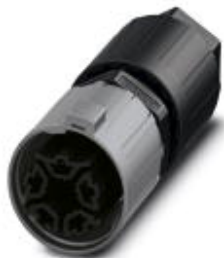
QUICKON connector, black, 4+PE-pos., 1.0 mm 2 ... 2.5 mm 2 /690 V/20 A, with QUICKON nut, for cables with 6 mm ... 11 mm diameter.

Please be informed that the data shown in this PDF Document is generated from our Online Catalog. Please find the complete data in the user's documentation. Our General Terms of Use for Downloads are valid ( http://phoenixcontact.com/download )