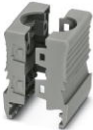
Cable housing, Length: 19.9 mm, Width: 49 mm, Height: 36.8 mm, Number of positions: 14, Color: gray

Please be informed that the data shown in this PDF Document is generated from our Online Catalog. Please find the complete data in the user's documentation. Our General Terms of Use for Downloads are valid ( http://phoenixcontact.com/download )